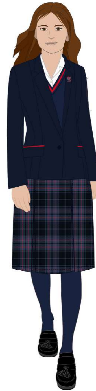
Senior School Uniform Code B