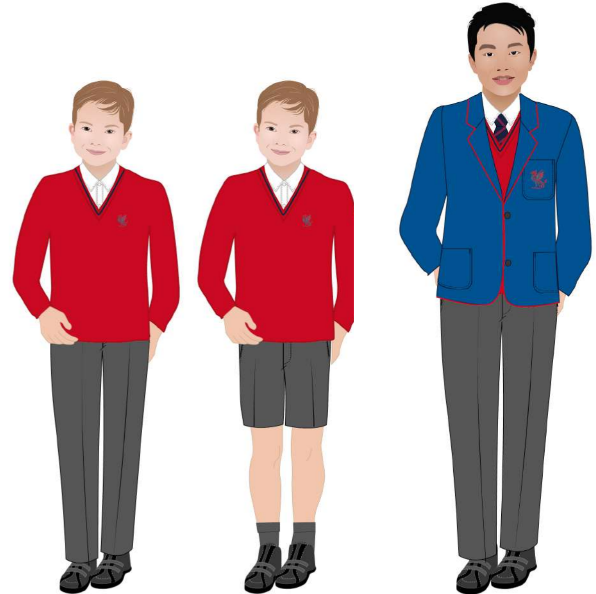
Pre-Prep Uniform Code A