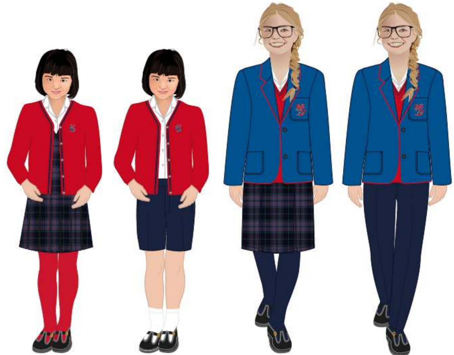
Pre-Prep Uniform Code B

Further compulsory items - some are available from Schoolblazer but can also be purchased elsewhere: